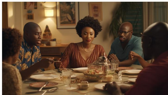
DAY 2 - She prepares a simple, delicious meal for family