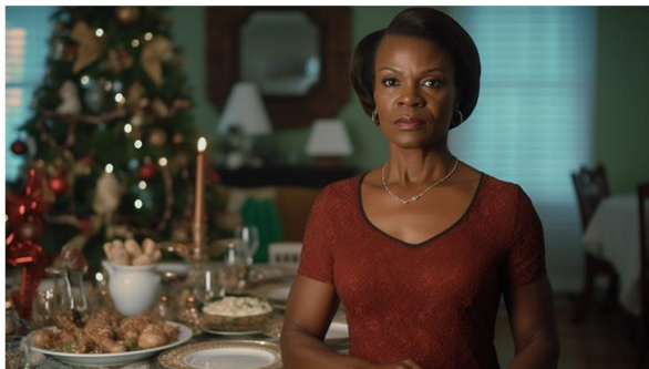
The mom stands with a hint of sadness in her eyes