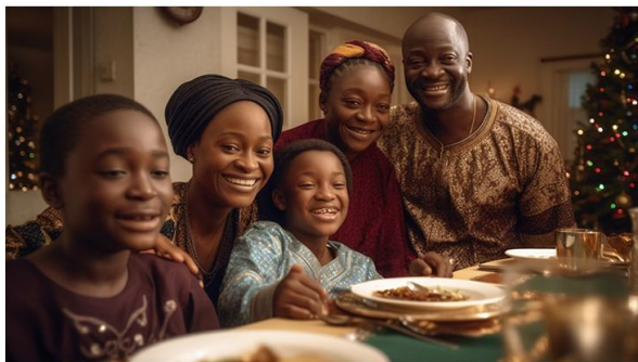
Family take pictures just before picking up their gifts