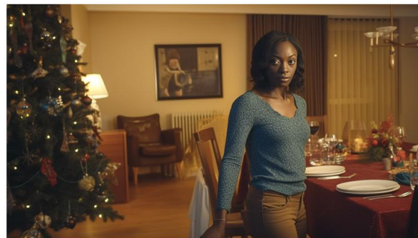
Mom left alone as family retreats to their devices