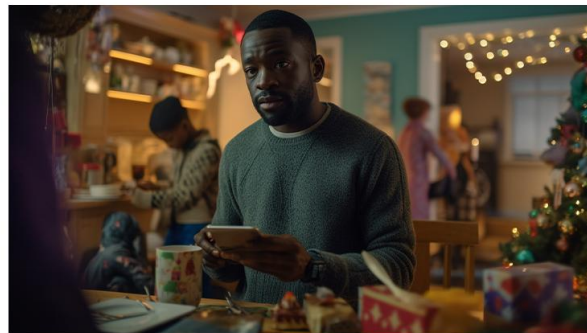
The dad, absentmindedly watching the news on the TV but fixated on his phone