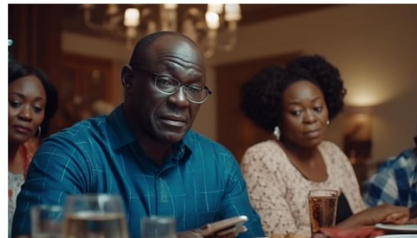
They grab their plates and return to their screens, leaving her disappointed