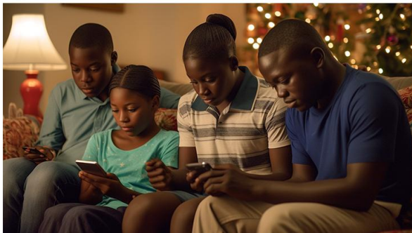
Family members engrossed in their devices